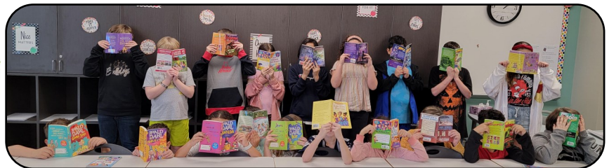
Book Project: Hillcrest Elementary & Highland Park Elementary